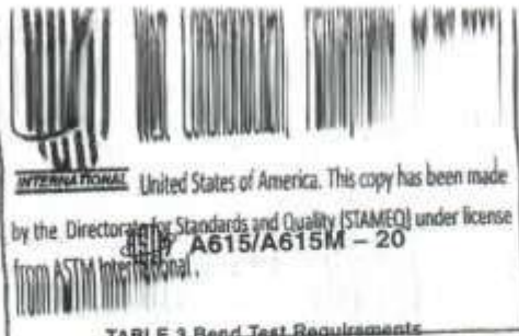
TABLE 3 Bend Test Requirements